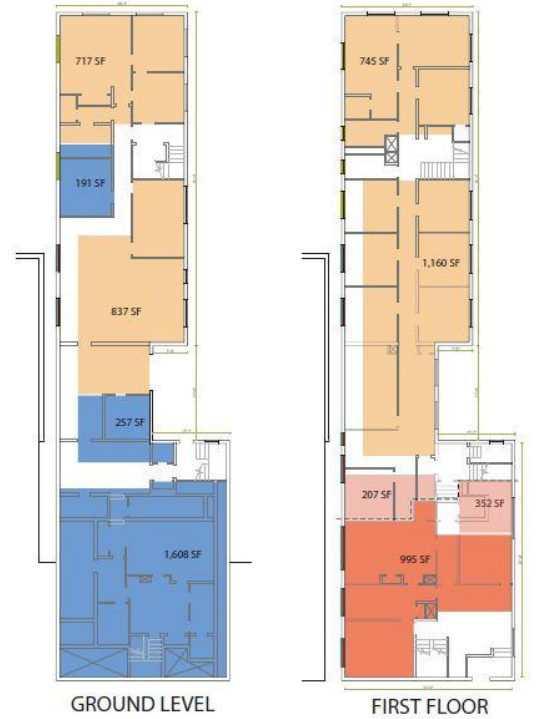
54 Eastern Ave., Mixed Use Redevelopment Malden, MA