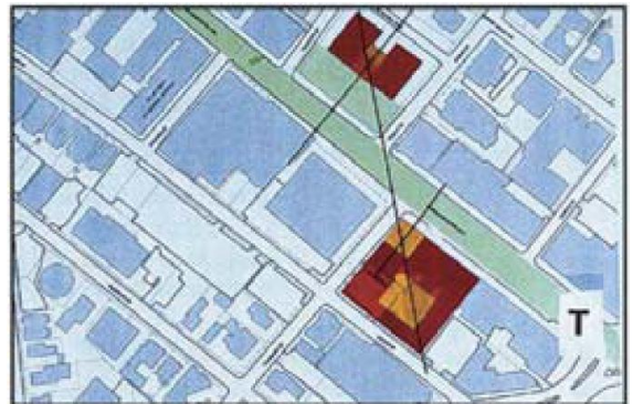
Cambridge Library Site Selection